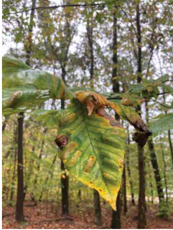
Figure 3.—Advanced symptoms of BLD with chlorotic striping.