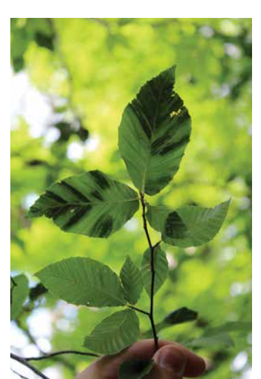
Figure 1.—Banding appearance associated with BLD.

BLD appears to be spreading, particularly from west to east based on the number of new county detections in recent years. Insect or avian vectors as well as human-mediated movement of the nematode are possible modes of its dispersal that are currently being studied. There is likely a delay between initial nematode infestation and BLD detection as L. crenatae has occasionally been confirmed in asymptomatic tissue at the molecular level.