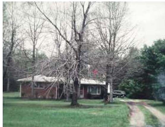
Suburban yard in late June - trees were defoliated by gypsy moth caterpillars.

Responding to the defoliation in 2007 and to population predictions from the 2007 fall egg mass survey program, MDA's Gypsy Moth Suppression Program sprayed 99,222 acres in the spring of 2008. Statewide that year, the caterpillars defoliated the trees on 19,279 acres. In the ensuing years the population has continued to cycle up and down. The year 2009 brought a need to treat 32,543 acres, while in 2010 only 144 acres were treated, and no areas needed treatment in 2011. Acres treated rebounded to 2,303 in 2012, increased to 11,996 acres in 2013, and 5,164 acres in 2014. Gypsy moth populations go through cycles, but are heavily influenced by seasonal weather conditions, and can fluctuate from a low to a high potentially damaging level in as little as two years.