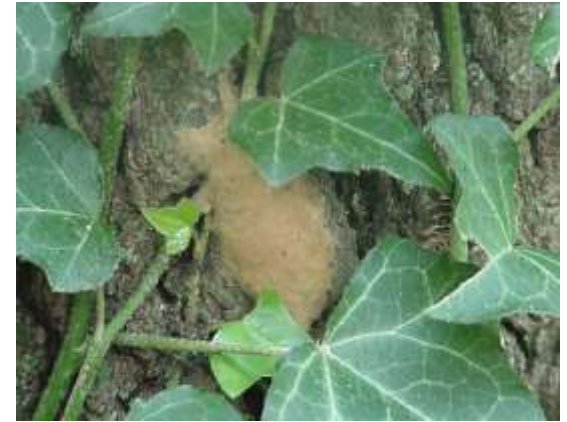
Gypsy moth egg mass

Gypsy moth caterpillars do all the harm. They hatch in large numbers - an egg mass can contain more than 1000 eggs - and the caterpillars feed ravenously on leaves.