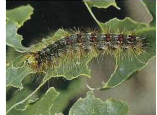
Late instar gypsy moth caterpillar.

Maryland Department of Agriculture Forest Pest Management Section 50 Harry S. Truman Parkway Annapolis, Maryland 21401 www.mda.maryland.gov