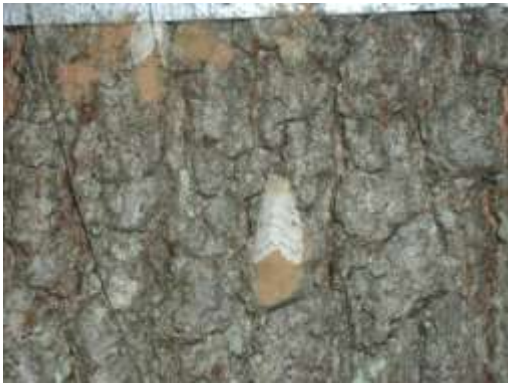
Adult female gypsy moth with egg mass

A native of Europe, the gypsy moth ( Lymantria dispar ) was accidentally released in Massachusetts in 1869. Infestations of the pest have gradually spread, leaving behind millions of acres of defoliated trees. Since 1980, the gypsy moth has defoliated more than one million acres in Maryland. During this period, the Gypsy Moth Cooperative Suppression Program sprayed the trees with carefully selected insecticides on another 1.8 million acres statewide. The suppression spray program has protected the trees from severe leaf loss on an average of over 97 percent of the acreage treated each year.