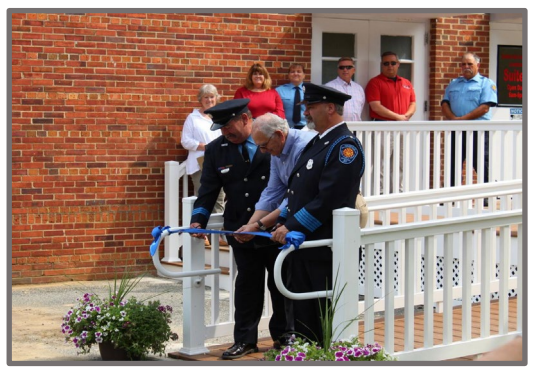
Sudlersville Volunteer Fire Company, Public Laundromat Facility - $48,655