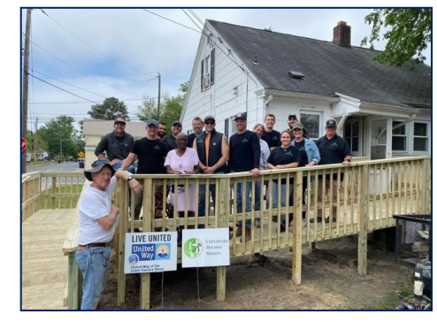
Chesapeake Housing Mission, Inc., Healthy Homes Initiative -