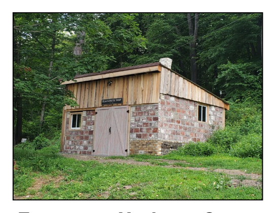
Evergreen Heritage Center, Appalachian Coal Camp Project $25,000