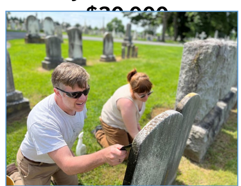
Preservation Maryland, Restoring the Past & Building Tomorrow's Leaders - $34.535