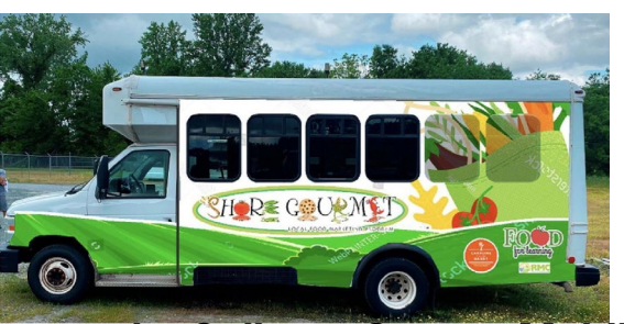
Chesapeake Culinary Center, Mobile Market Project $20,000