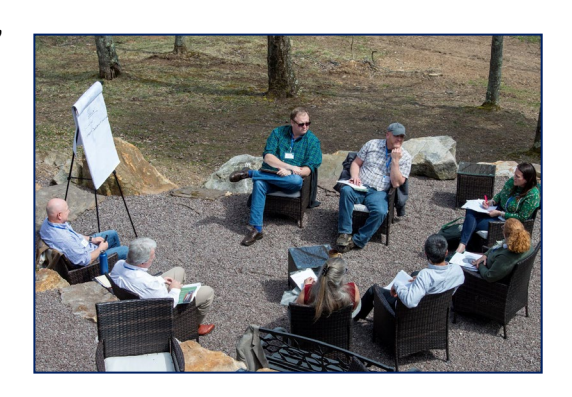
The Greater Cumberland Committee, ESG Charette - $175,000