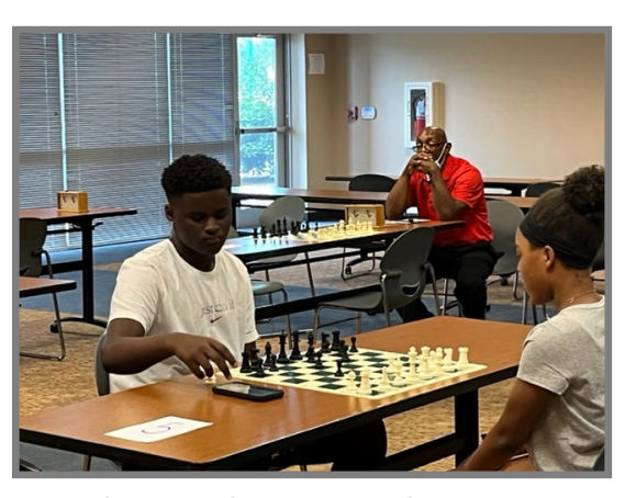
People For Change Coalition, Summer Enrichment Program - $70,000