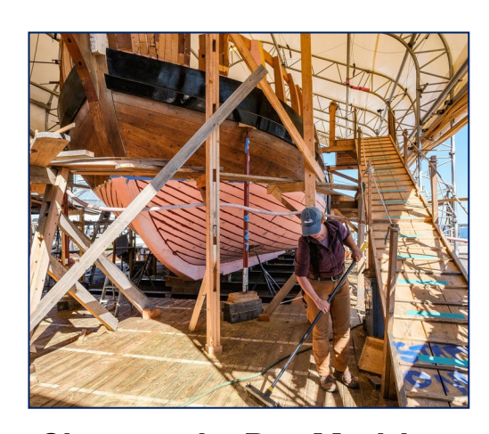
Chesapeake Bay Maritime Museum, Shipwright Apprenticeship Program -$34,535