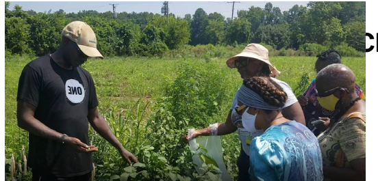
STEAM Onward, Inc., More Than Farming Project $13,450