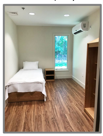
Channel Marker, Inc., Psychiatric Crisis Bed -$125,000