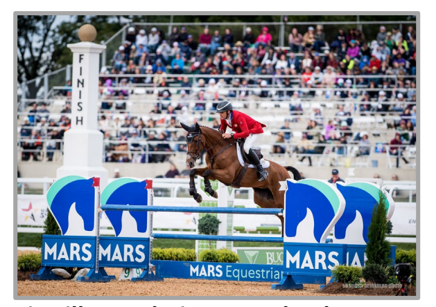
Fair Hill Foundation, Maryland 5 Star at Fair Hill - $50,000