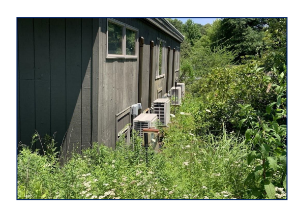
Adkins Arboretum, HVAC Installation $40,000