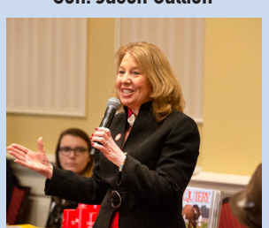
Sen. Marybeth Carrozza