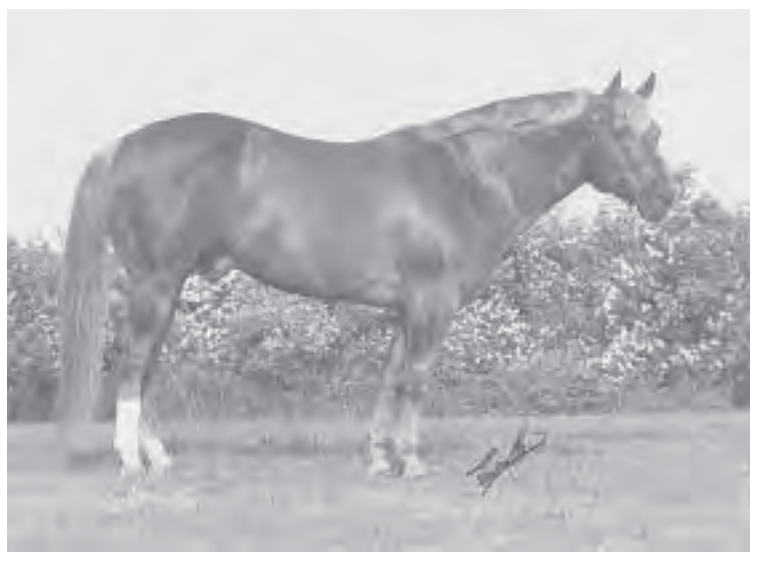
Nylon Lad was a real good-looking "using" horse.

The greatest danger in a linebreeding program is that it intensifies all of the genes—good and bad. In a linebreeding program, you, as the breeder, find out what is good and bad about your program in a hurry.