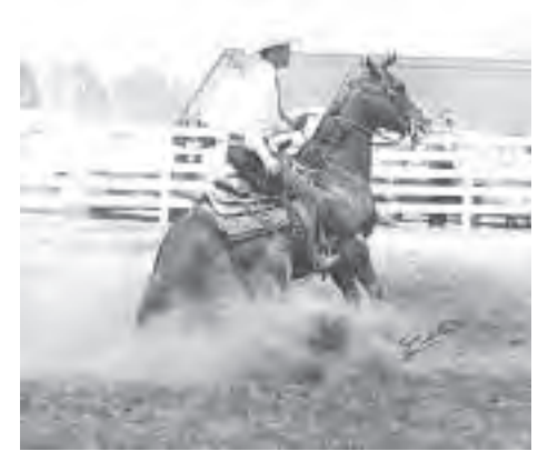
Dam: Elm's Nylon Lady, by Skipper's Lad by Skipper W, was also shown to AQHA Champion by Paul Babington and was the dam of one Superior Halter-Show ROM horse and at least 2 point earners

It is also true that many of the Skipper W bred horses sired horses that were tough minded and smart. They were performance bred and they wanted to go do ranch work. It was easier to make those big-muscled horses into halter horses than it was to get them to like trailing their tails around a show pen. Many of the Nylon Lad horses rode better the farther west they got where people were more used to their mind-set. But Nylon Lad