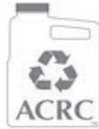
Ag Container Recycling Council

The Maryland Department of Agriculture, Pesticide Regulation Section would like to thank all of its private cooperators and participants for making this a successful and worthwhile program. We would like to especially thank the Ag Container Recycling Council (ACRC) and USAg Recycling, Inc. Without their assistance and dedication, this program would not be possible.