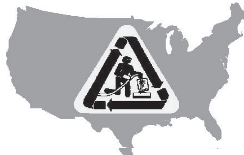
USAg Recycling, Inc.