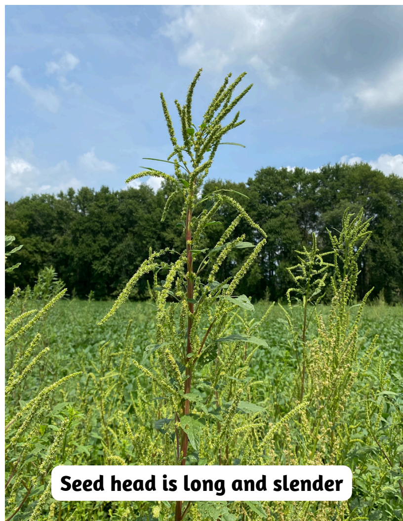
Seed head is long and slender