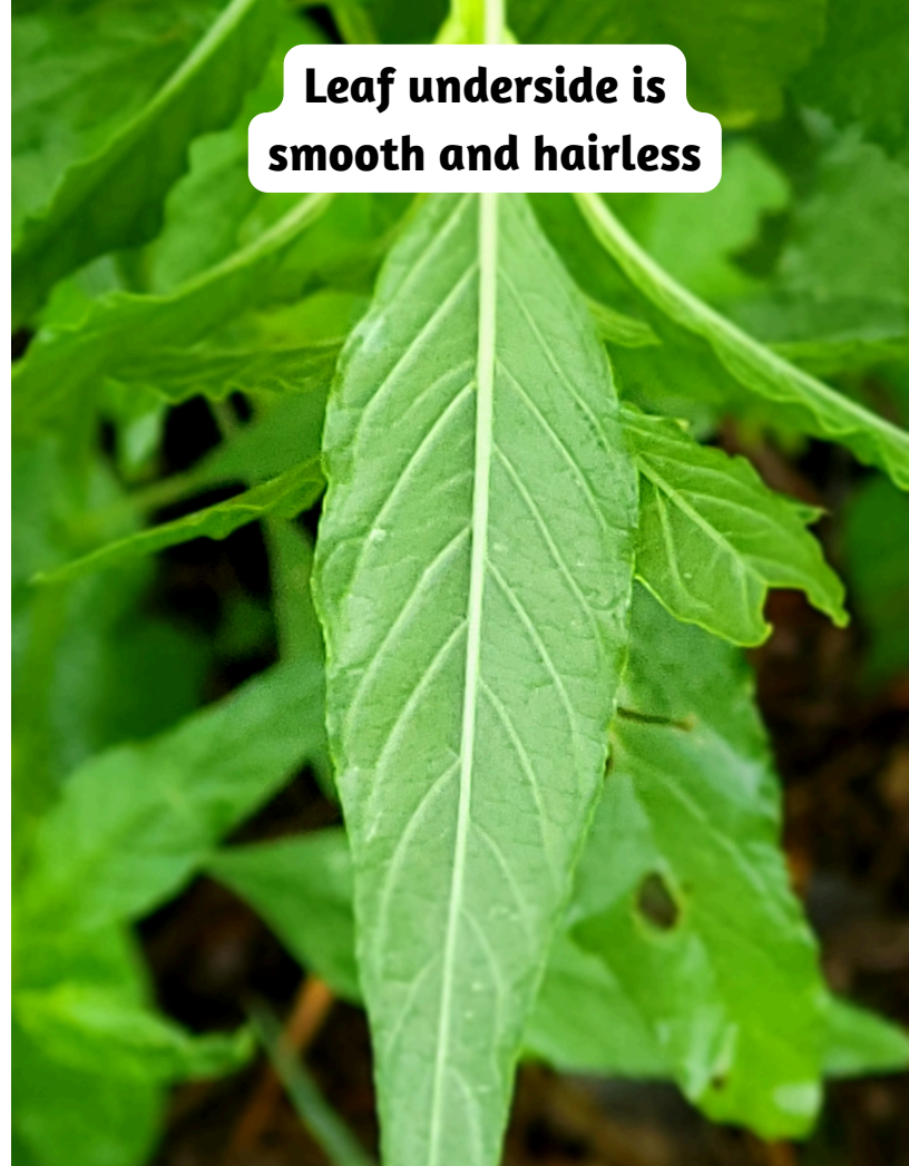
Leaf underside is smooth and hairless