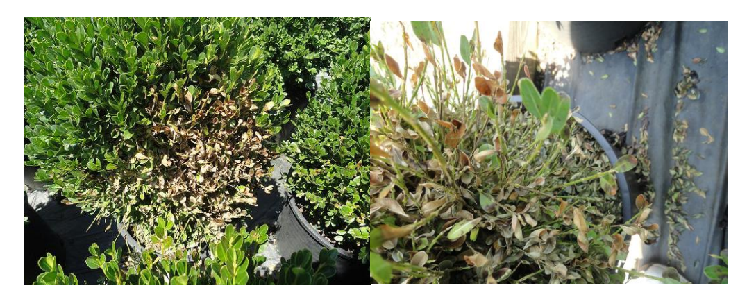
Fig 1. Blighted plants-with twig blight (left), dark brown lesions on the leaves and stem followed by excessive defoliation, accumulating fallen leaves on the ground (right) indicate an infection by Cylindrocladium pseudonaviculatum.

The optimum temperature range for the boxwood blight pathogen to grow is normally 64° to 77° F, which is typical during spring and fall in the northeastern U.S. The disease does not thrive below 50° F in winter or above 86° F in summer. In adverse conditions when the fungus mycelium is killed, resting structures (microsclerotia and/or chlamydospores) are produced which can survive for up to several years in the environment and in the soil. In favorable conditions, the pathogen might complete its life cycle in 7 days. The pathogen spreads by wind-driven rain or splashing water over short distances and is most infective in conditions of high humidity. Wind-borne spore dispersal is not known but is likely limited to shorter distances. Infection can also be spread by infected plant refuse, contaminated equipment and clothing, and by household pets and other animals.