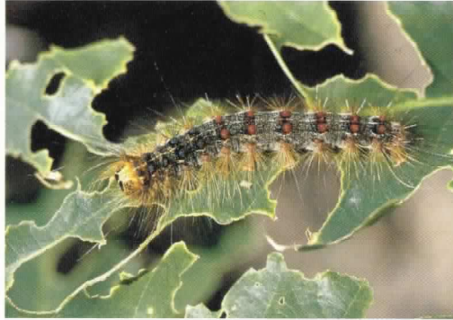
Gypsy Moth Caterpillar