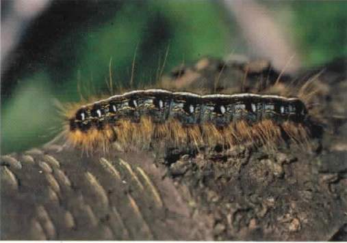
Eastern Tent Caterpillar