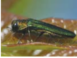
EAB adults must feed on foliage before they become reproductively mature.

effective pheromone traps for EAB. However, first emergence of EAB adults generally occurs between 450-550 degree days (starting date of January 1, base temperature of 50°F), which corresponds closely with full bloom of black locust ( Robinia pseudoacacia ). For best results, consider two applications, one at 500 DD 50 (as black locust approaches full bloom) and a second spray four weeks later.