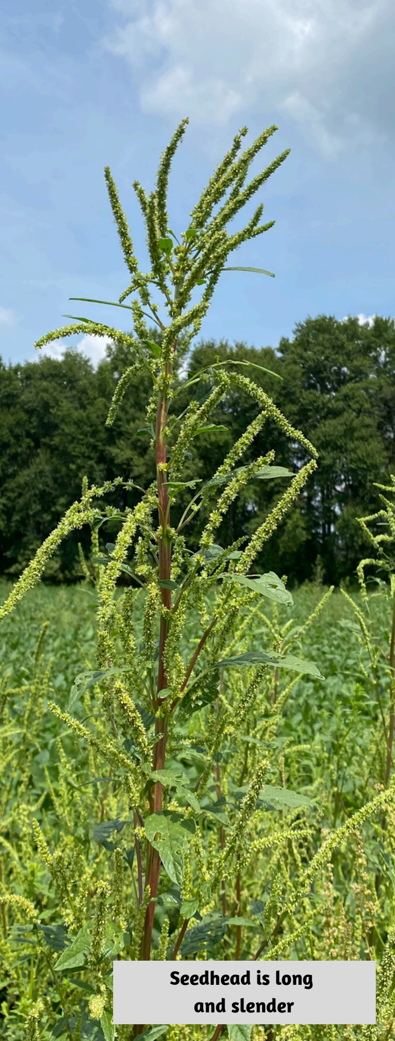
Seedhead is long and slender