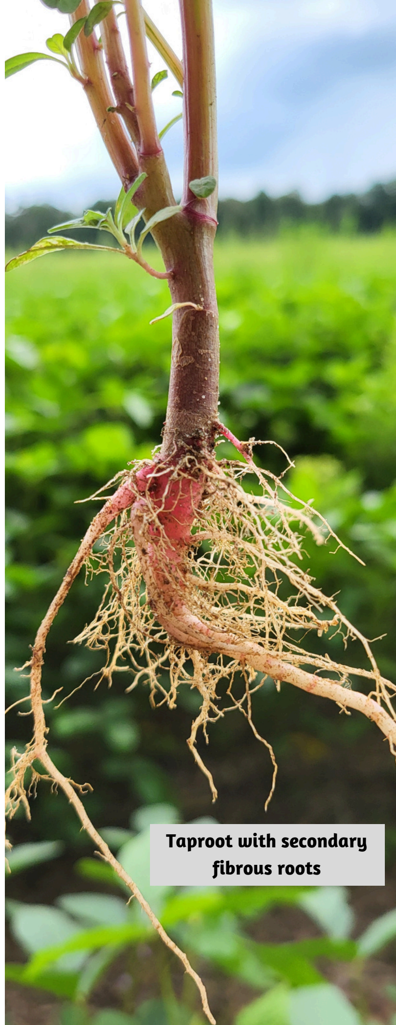
Taproot with secondary fibrous roots