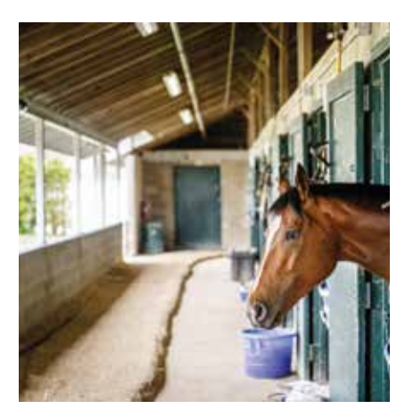
Horse operations with 8,000 lbs. or more of live animal weight or $2,500 in gross farm income are required to follow nutrient management plans.

Winter Restrictions on Applying Manure—All operations— regardless of size—are prohibited from applying manure and other nutrient sources to fields between December 16 and March 1. Livestock manure deposited directly by animals is exempt from this requirement.