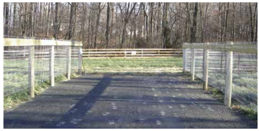
Completed heavy use pad.