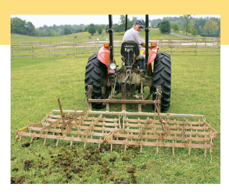
Periodic dragging can break up manure and minimize spotty growth.