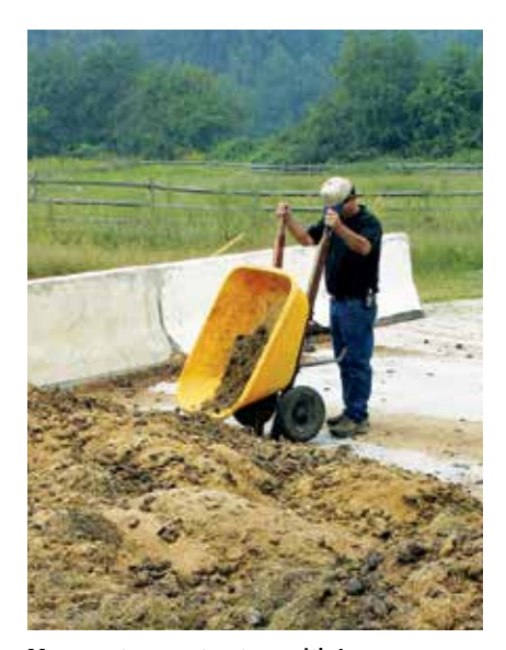
Manure storage structure with Jersey walls and concrete floor.

LEARN MORE... Go to: mda.maryland.gov/HOW