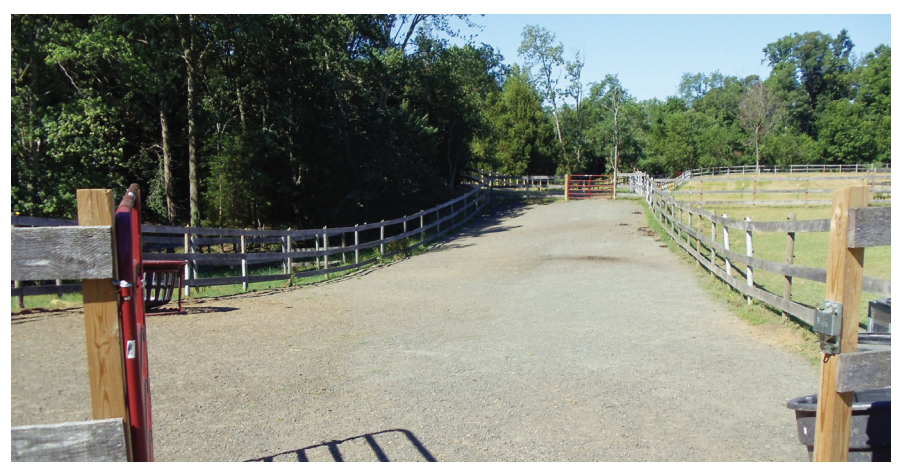
A sacrifice lot gives stressed pastures time to recover and can help manage your horse's weight.