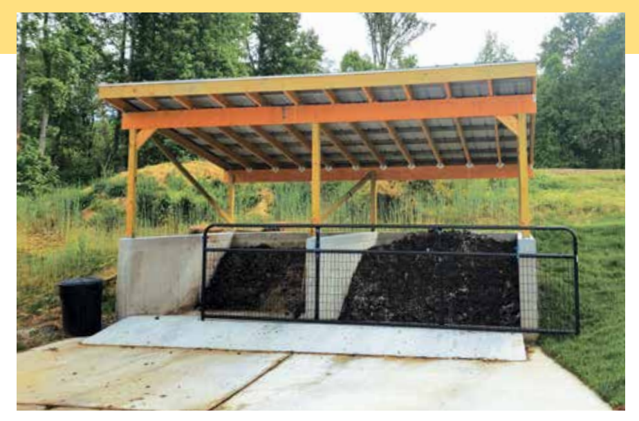
Composting is a great way to recycle manure resources.