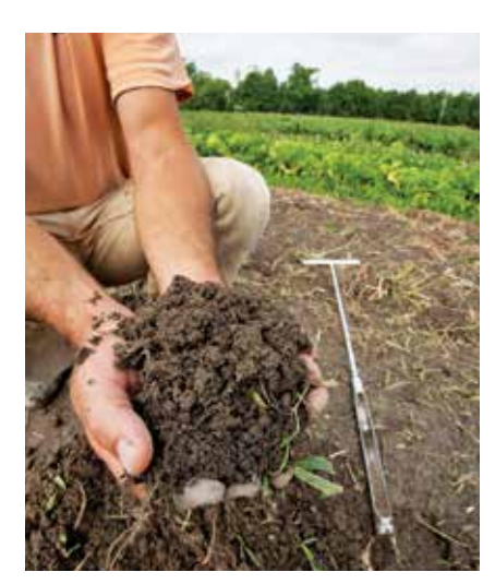
An inexpensive soil test can help you determine the type and amount of fertilizer needed for good pasture growth.

There is an old saying, "Take care of your soil, and your grass will take care of itself." Soils vary widely, even across your pastures. So to begin, you must know your soil type, pH (acidity or alkalinity), and its capacity to hold water and nutrients.