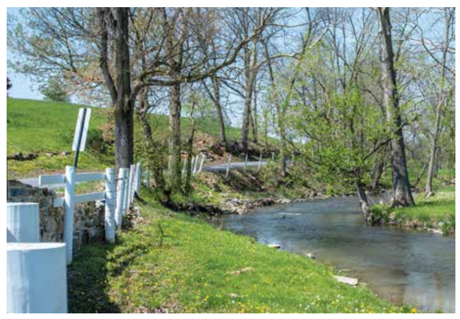
Your local soil conservation district can provide free technical assistance to design stream protection measures for your operation.

Maryland's nutrient management regulations require regulated horse operations to install pasture management practices under the guidance of local soil conservation districts to protect streams from livestock impacts. But it's a good idea for all horse operations—large and small—to keep animals away from streams. Contact your soil conservation district for free help in designing stream protection measures for your operation.