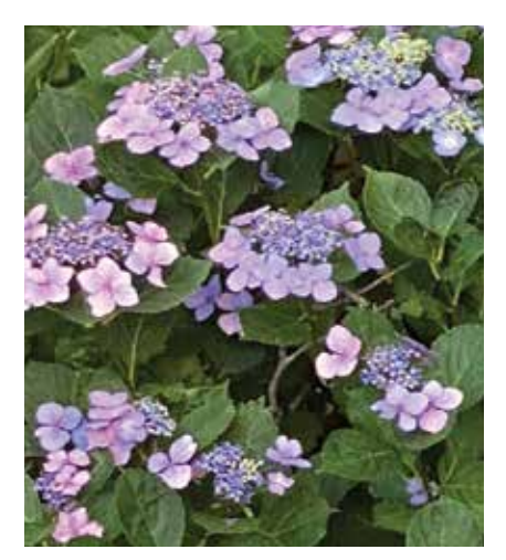
The leaves, buds and flowers of the hydrangea are toxic to horses. Do not plant too close to the fence or where horses can eat them.

Keep in mind that when sprayed with herbicides, wilting plants can be very tasty to horses. If you suspect that your horse has eaten a toxic plant, contact your veterinarian immediately for an emergency visit.