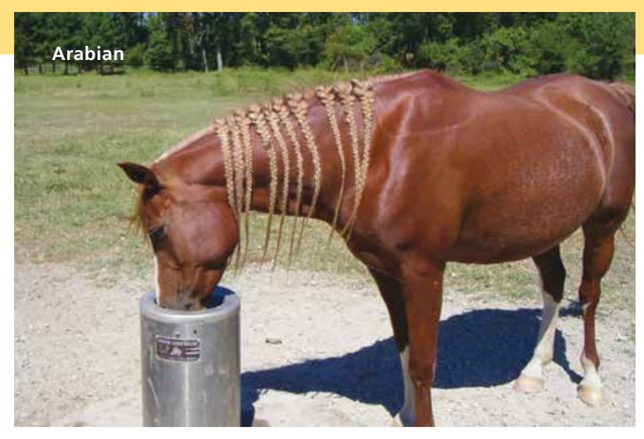
Watering troughs provide a clean, reliable water supply for animals away from streams.

Avoid excessive fertilizer and pesticide applications that may cause plant disease and become a potential source of groundwater and surface water pollution. Have your soil tested to develop a nutrient management plan that reflects the nutrient needs of your pasture (see next section).