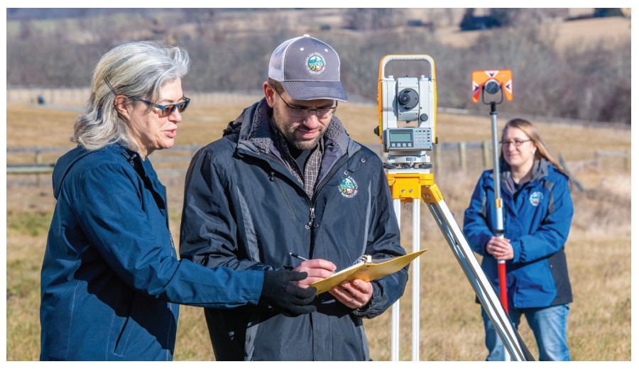
Contact your local soil conservation district for free assistance in developing a Soil Conservation and Water Quality Plan for your operation.