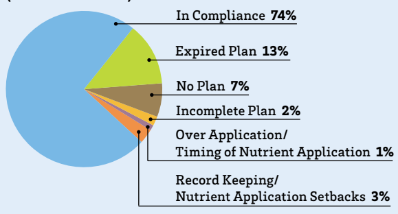
FIGURE 3: Results of Follow-Up Audits (Fiscal Year 2022)